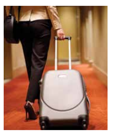
There is NO WAY to keep bed bugs out. Guests keep bringing them in. The solution is early detection.

The Delta Five system can find a single bed bug before guests, hotel staff, pest management providers or canines. Unlike reactive and expensive heat-treatments or spraying, the Delta Five eLure™ electronic lure, delivers proactive 24/7 monitoring of guest rooms to attract and trap the bugs. A notification is instantly sent over WiFi to hotel staff via text or email. Our cloud-based system retains capture data and enables you to track trends and forecast potential issues.