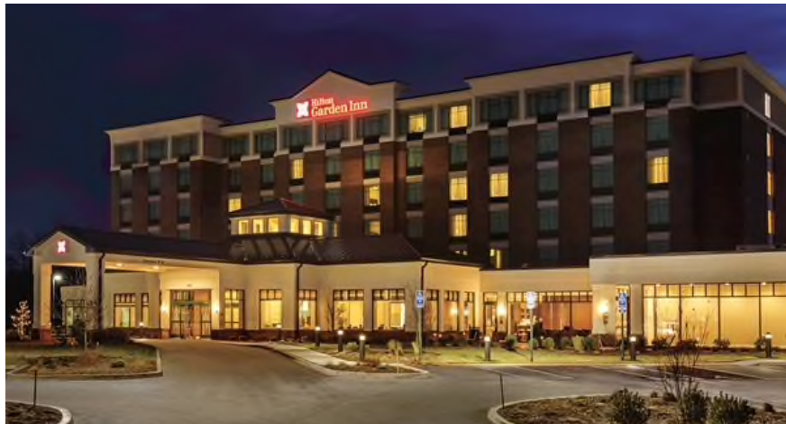
The Hilton Garden Inn Wallingford provides excellent accommodations and a convenient location for business and pleasure travelers.